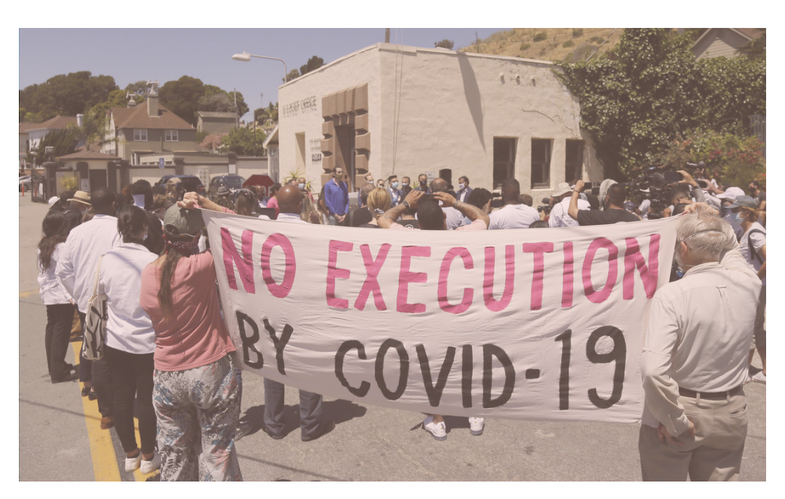
A group of legislators, advocates, academics and public health officials gathered outside San Quentin State Prison in California to discuss a COVID-19 outbreak at the facility in July 2020.

Early in the pandemic, advocates were successful in securing greater use of compassionate release for older incarcerated individuals, those with underlying health conditions, and for people who were near their release date, which resulted in an 8% reduction in the U.S. prison population. However, focus appears to be shifting from a public health approach back to one prioritizing incarceration. For example, although the Biden Administration recently released quidance and a funding opportunity aimed at mitigating the impact of COVID in prisons, jails, and juvenile facilities, the federal Bureau of Prisons considered requiring the 4,000 people who were released to home confinement due to the public health emergency to return to prison. Should these individuals be returned to prison, despite being close to the end of their sentences, having met criteria to qualify for early release, and having successfully reintegrated into their communities, it will be clear our political leaders place a greater value on punishment than promoting public health and successful reentry. Although efforts to expand compassionate release did lead to an 8% decrease in the US prison population, the decline will be temporary without structural changes to the front-end of the criminal legal system, including meaningful reforms to policing and sentencing.